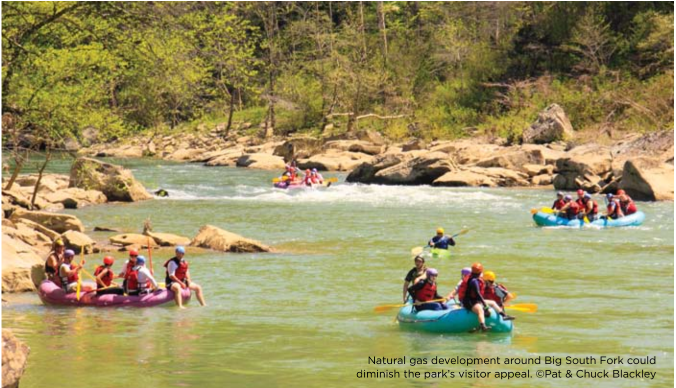
Natural gas development around Big South Fork could diminish the park's visitor appeal.

Oil and gas drilling has existed for many years on Tennessee's Cumberland Plateau, occurring within park boundaries and adjacent to the Big South Fork National River and Recreation Area and Obed Wild and Scenic River. Both parks contain privately owned oil and gas wells within their boundaries, and both are seeing oil and gas development on lands adjacent to their borders. Concerns about future projects—including hydraulic fracturing—are also mounting. Recently, wells were drilled into the Chattanooga shale (the southernmost reaches of the Marcellus shale). A drop in the price of natural gas has delayed more drilling. As the price of natural gas increases, the Chattanooga shale in or adjacent to the parks will be drilled, and impacts to the parks and their resources will likely continue.